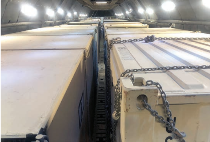
Internal Storage Units (ISU) 90s.

case 90 means 90 inches. But since they are designed to use the maximum cubic volume even if they are empty, they are not easy to walk around or load. (There are 30 in the picture. As far as what is in them, OPSEC limits the description to “stuff” or “empty”).